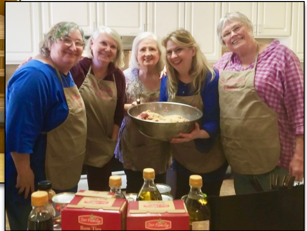
Daughters at St. Timothy's Chapter, Coppell, TXs added new members, November 14, 2021.