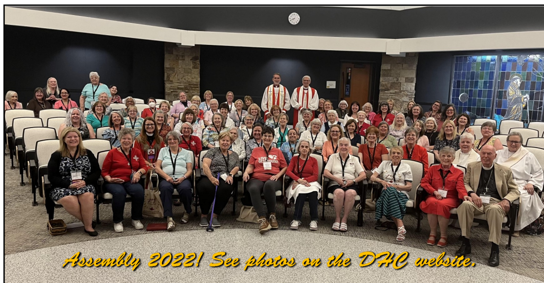
Assembly 2022! See photos on the DHC website.