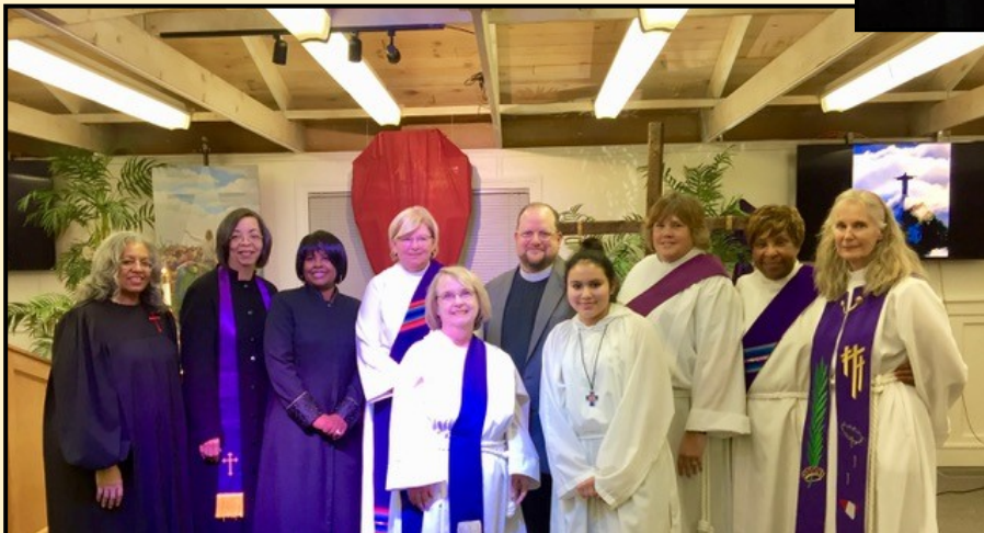
Right to left: Women clergy speakers from The Anglican Diocese of Great Lakes, the Evangelical and Pentecostal congregations with the rector of St. Luke's Church, the hosting church.