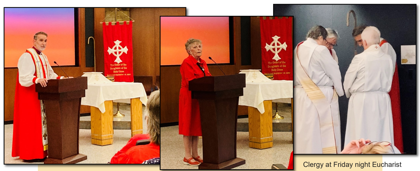
Archbishop Foley Beach at Friday night Eucharist