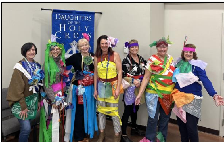
Some of the Daughters in attendance show off their fashion style!