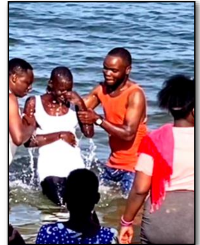
Coming out of the water as a new creation in Christ!