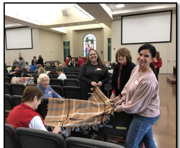
The fleece blanket project underway