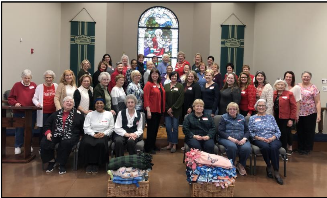
The Daughters at the Gathering pose with the fleece blankets they created.