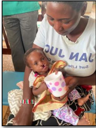
Ugandan mother and child

Prenatal Conference where we had over 300 pregnant women in attendance for a full day of teaching. They were fed three meals and then given food to take home, in addition to a Mama Kit, which contains all the sterile supplies needed for a safe birth. These kits are out of reach for most village women because of the cost of $7.00 each.