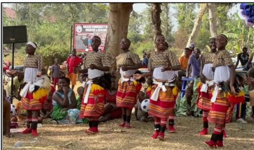
Girls' dance and choir group entertain in traditional clothing

In addition to all the teaching and worship with the mothers, we held 3 conferences in 8 days there. The first conference was a