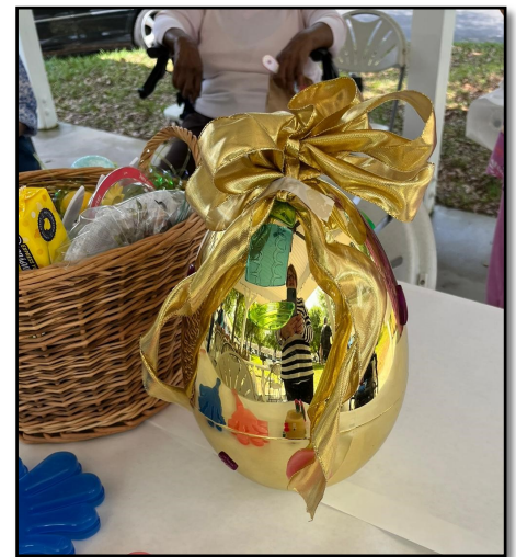
The Golden Egg was the grand prize!