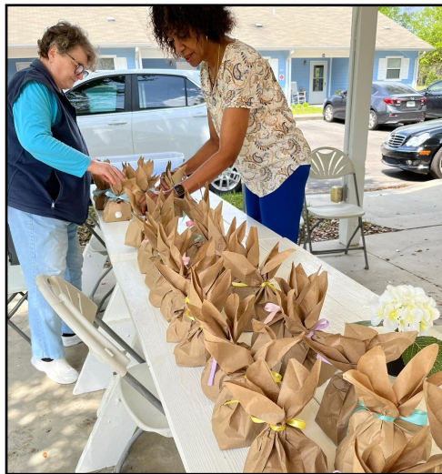
Easter "bunny treat" bags are prepared to hand out to guests.