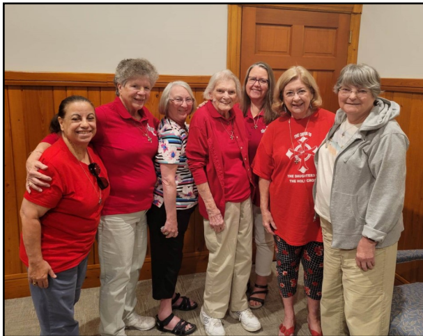
Grace Chapter, our hostesses