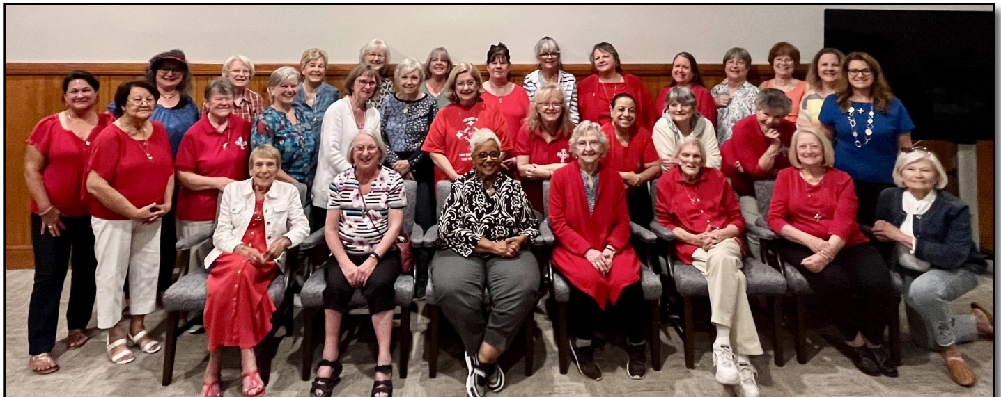
Participants at the Florida Regional Gathering. See more pictures from the Gatherings on page 5.