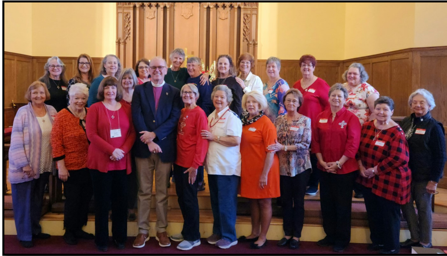
Participants at the Tennessee Gathering.