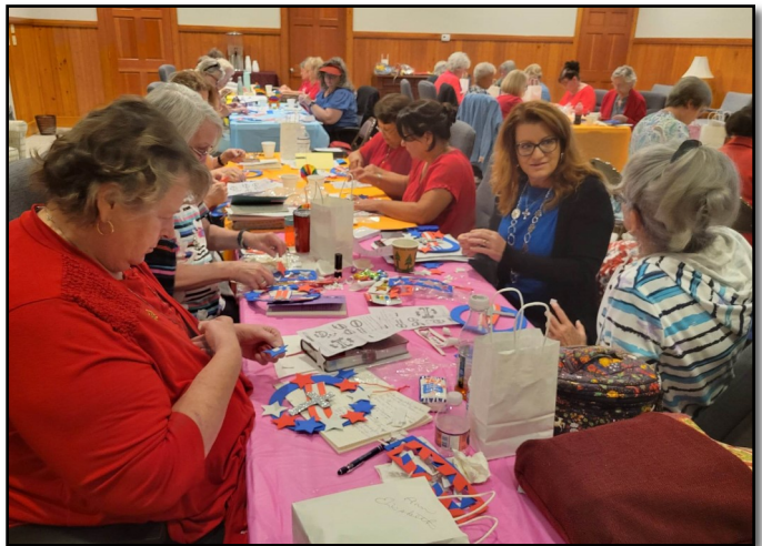
Arts & Crafts time at the Florida Gathering.