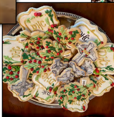
Who could resist one of these beautifully decorated cookies?