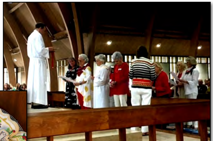
New members take their vow.