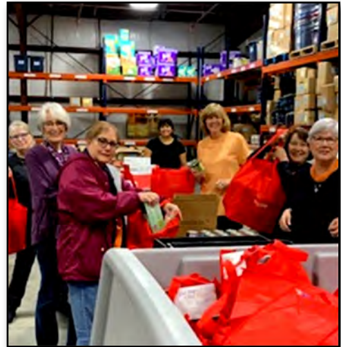
Faith in Christ Daughters pack bags for local families in need.