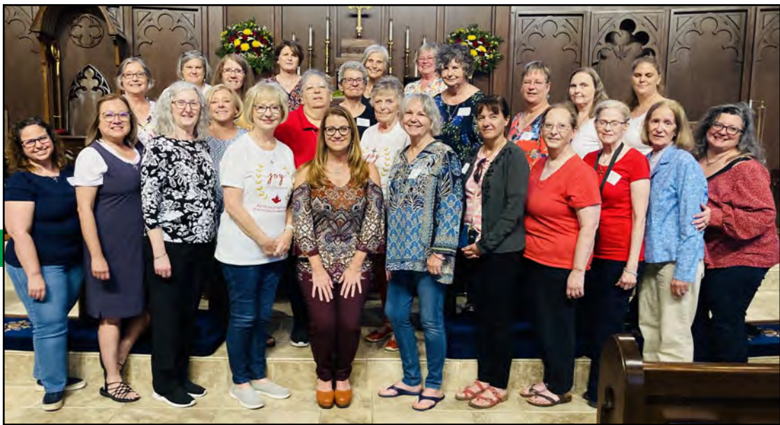
Attendees at Dallas Regional gathering in September