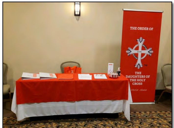
Daughters of the Holy Cross had a table at the conference.

How did the conference end? We all stood, raised our arms and voices to sing IN CHRIST ALONE!